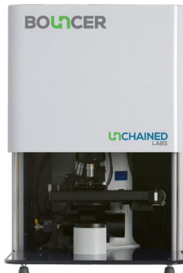
Figure 1: Bouncer measures silicone thickness, distribution and mass for silicone coated devices.

A 1 mL PFS was stored horizontally for 4 weeks. Following storage the thickness and distribution of silicone in the PFS was analyzed with Bouncer.