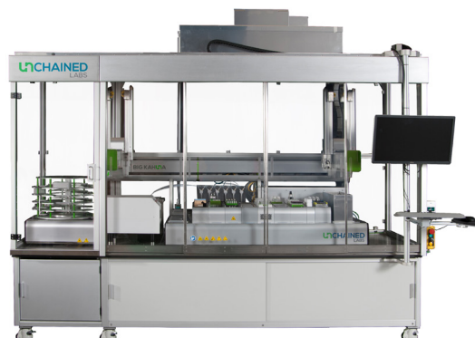
Figure 1: Big Kahuna with buffer exchange automates buffer exchange for up to 96 unique samples with the Unfilter 96.

Conventional exchange methods are labor intensive, prone to inconsistency, and difficult to manage in larger numbers. Automated buffer exchange systems can provide a more uniform sample handling approach and degrees of process control that are otherwise inaccessible by manual methods. Automating a platform buffer screen can further cut down the time required to optimize buffer conditions for new biologic mol-